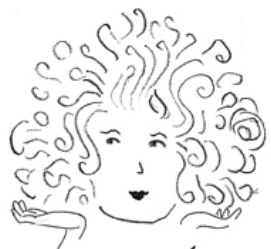
Hair Today ...