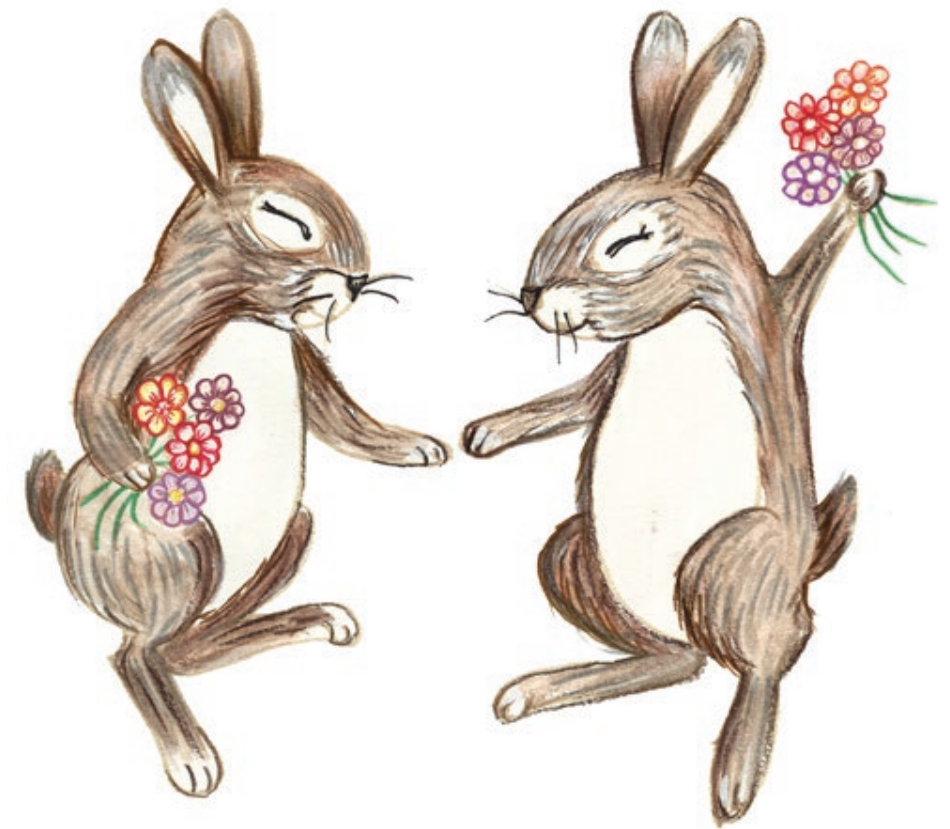
2015 The Forest of Forgiveness Personal Project Character, environment and lettering Pencil and digital illustration