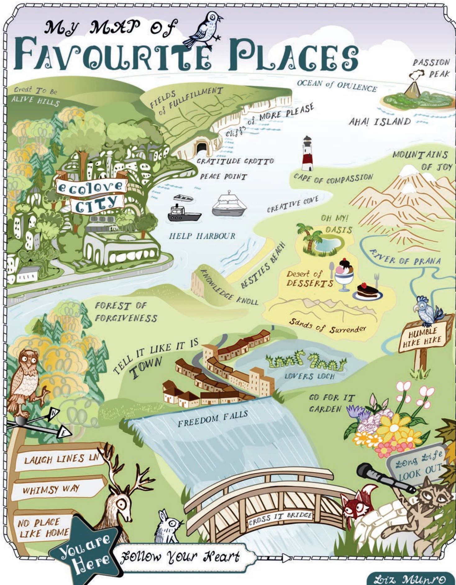
2015 My Map of Favorite Places Course B - Editorial project Pencil and digital illustration Make Art That Sells Lilla Rogers Studio School