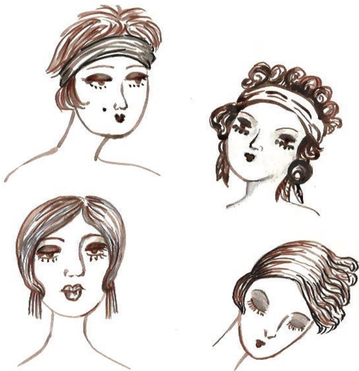
2016 1920s ladies Ink sketches