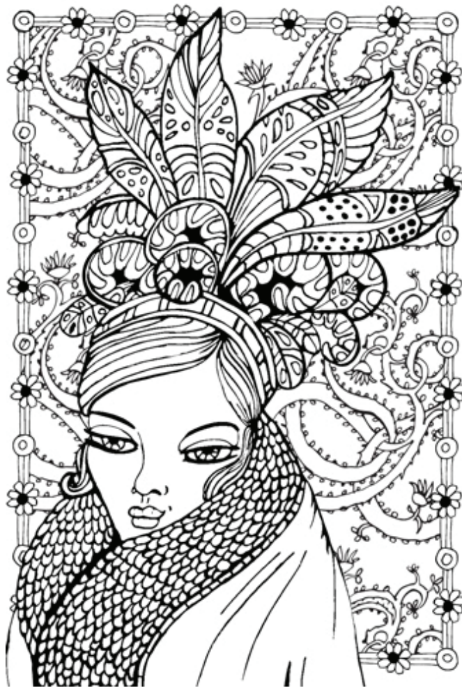
2016 Line art Postcard design Competition finalist Studio Montclair